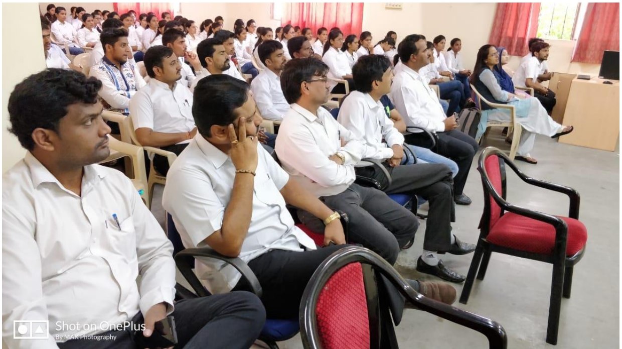
Audience attending the Awareness programme on GATE Examination.