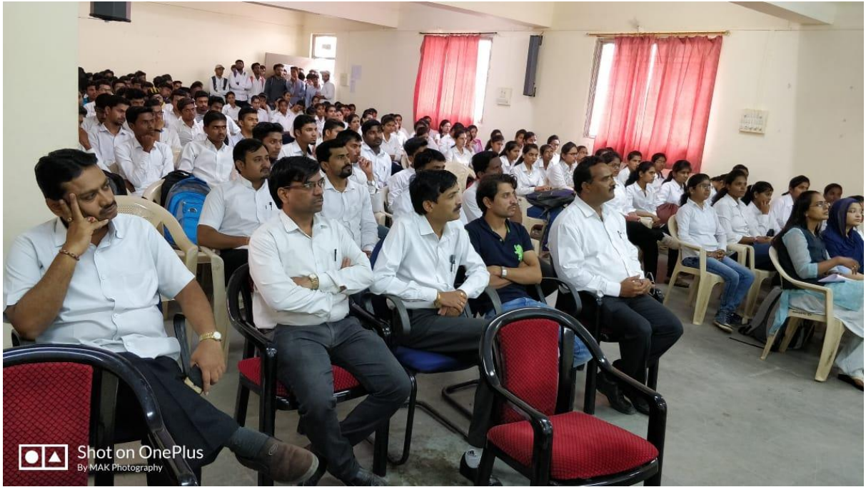
Audience attending the Awareness programme on GATE Examination.