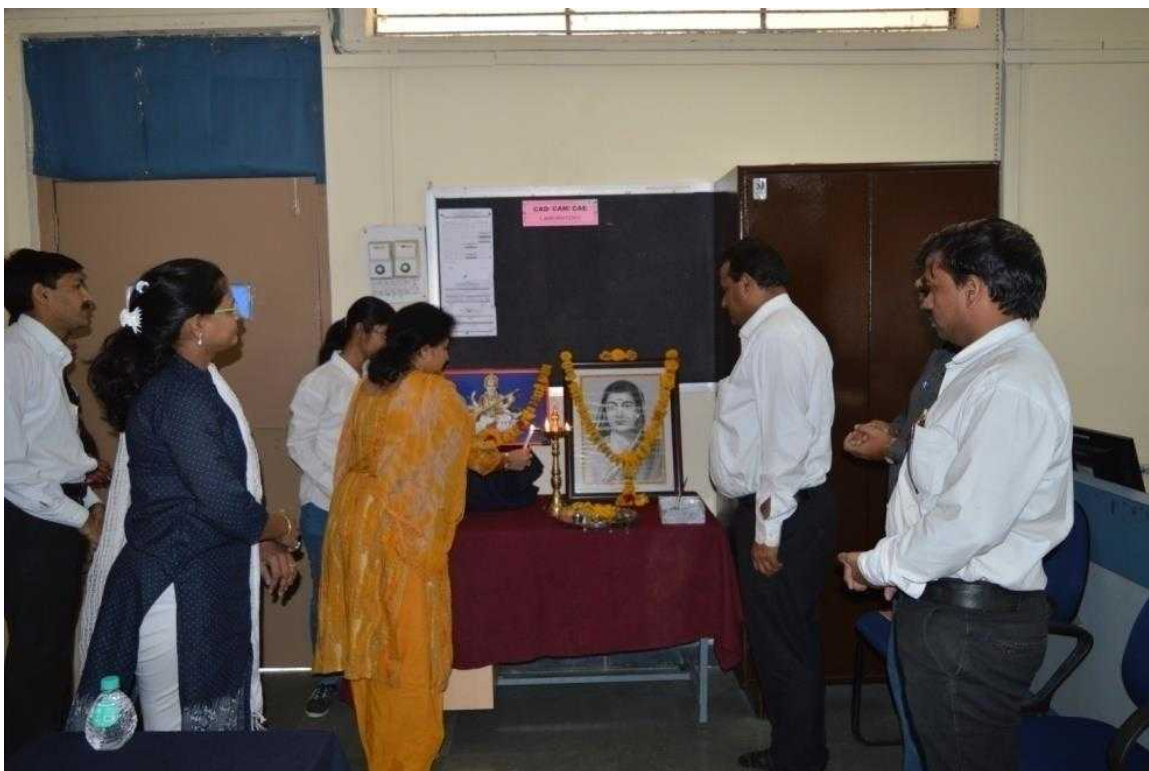
Lighting of the lamp during inauguration ceremony of Virtual Laboratories, Feb. 10, 2018.